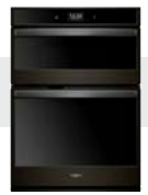
Fingerprint Resistant Black Stainless Steel (V)