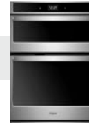
Stainless Steel (S)