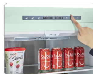
Intuitive digital control panel