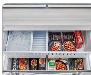
Deep frost free freezer with ice maker