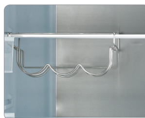
Adjustable three-bottle wine rack