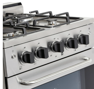
Modern knobs designed for cooktop & oven