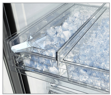
Dual Ice Maker with Cubed Ice and IceBites™