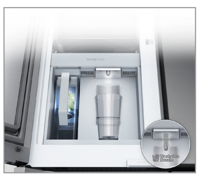
Beverage Center™ with AutoFill™ Water Pitcher

Be prepared for any occasion with two different types of ice. The Dual auto ice maker makes both cubed ice and ice bites.