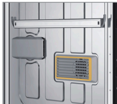
SmartDry™ with AutoRelease™ Door