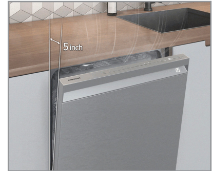
AutoRelease™ Door Dry