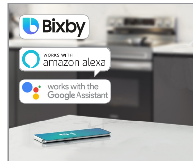
Wi-Fi Connectivity and Voice Control