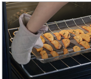
Air Fry 1