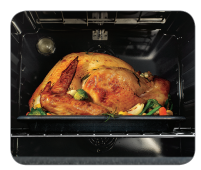
5.9 cu. ft. Capacity

Fingerprint Resistant Black Stainless Steel