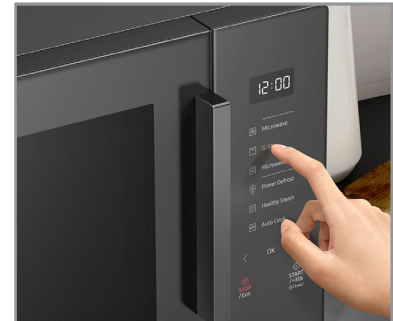
Glass Touch and Simple UX