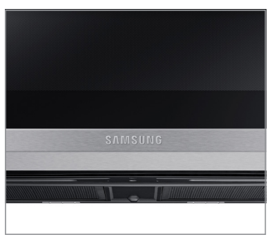
4-Speed/400 CFM Ventilation