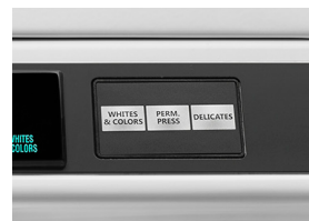
ONE-TOUCH CYCLE SELECTION