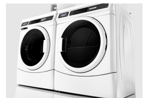
MATCHING WASHER AVAILABLE