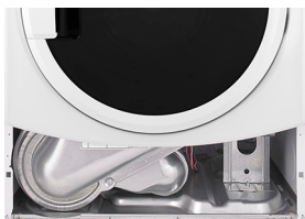
FRONT ACCESS PANEL