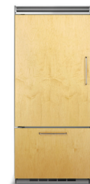
Solid Overlay (Panel Ready)*