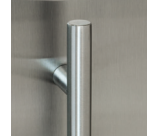
Slim Designer Handle Shown (MP36BF2RS)