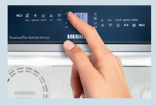
SuperCool/SuperFrost: Simply quick chill and or freeze fresh groceries to preserve optimum freshness and seal in flavors, textures as well as maintain essential vitamins and minerals.