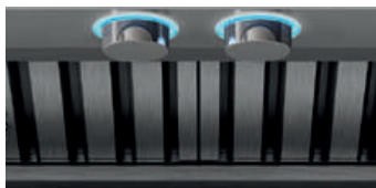
stainless steel professional baffle filters

For homeowners who are passionate about the culinary arts, the seamless welded corner craftsmanship, traditional styling and gleaming stainless steel of Calabria, provides the look and performance you expect from a professional-grade range hood. With the new backlit hidden knob controls and traditional baffle filters, Calabria is available in 30", 36", 42", and 48" widths and equipped with a 600 CFM (30") or 1200 CFM blower (36", 42", 48") to support all cooking needs.