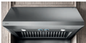
backlit hidden metallic in/out knobs