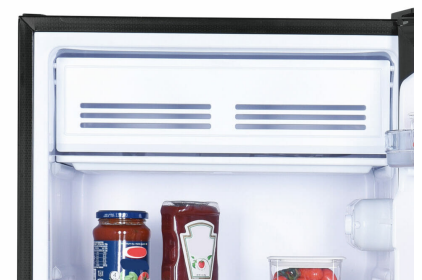
Full width chiller section