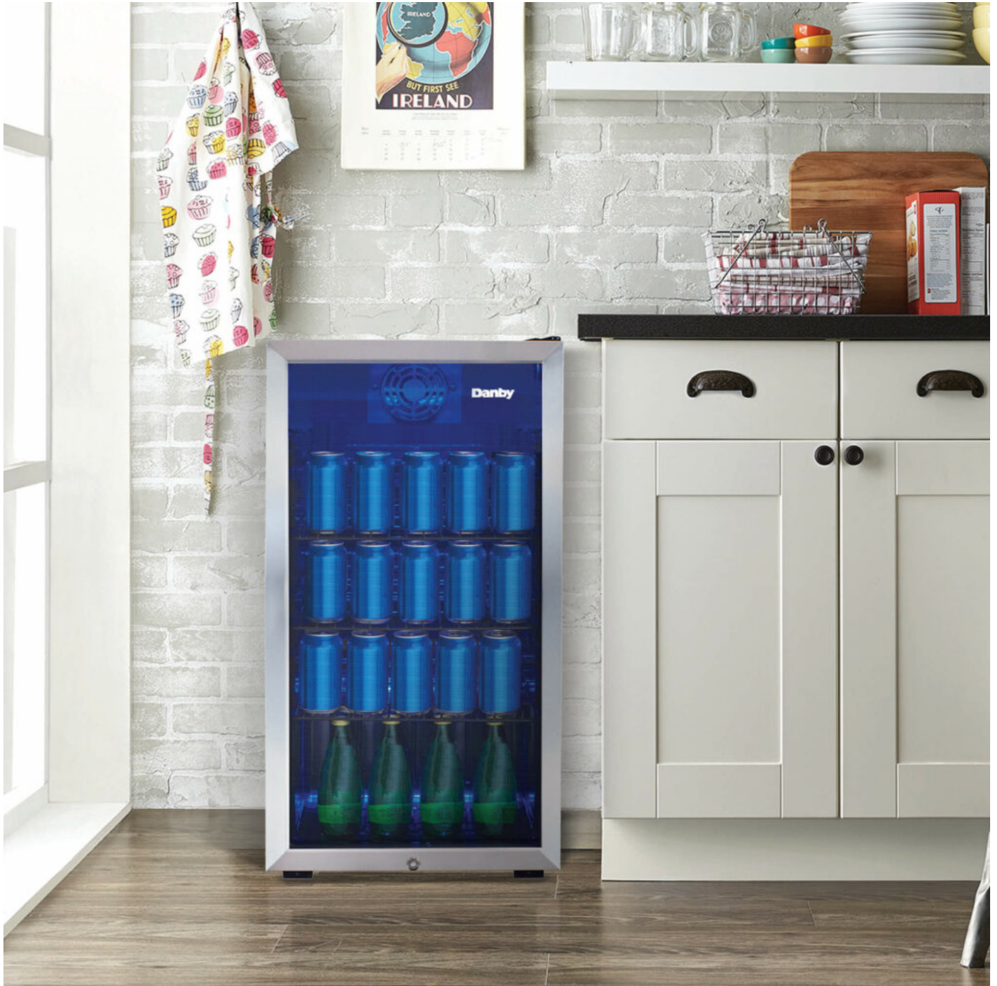
117 (355ml) Can Capacity