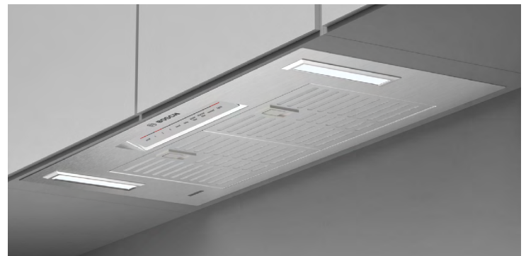
Installed in frameless cabinets

Accessories: To purchase Bosch accessories, cleaners & parts please visit www.bosch-home.com/us/store or call 1-800-944-2904 (Mon to Fri 5 am to 6 pm PST, Sat 6 am to 3 pm PST).