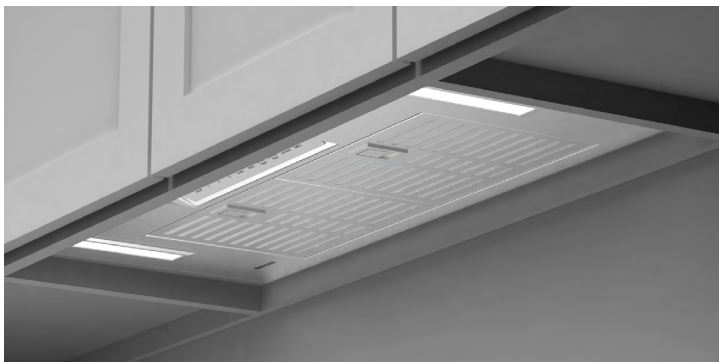
Installed in framed cabinets