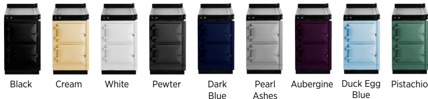
Black Cream White Pewter Dark Blue Pearl Ashes Aubergine Duck Egg Blue Pistachio

Cast iron range is coated in hygienic, easy-to-clean vitreous enamel